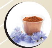
Inulin (Chicory extract) Hydrating