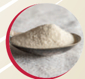
Xanthan Gum hydrating and viscosifying