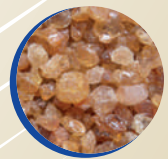
Guar Gum Soothing and softening