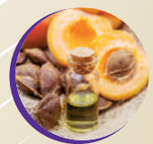
Apricot Oil Protective and emollient