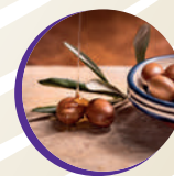
Argan Oil Protective and antioxidant