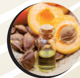
Apricot Oil Protective and emollient