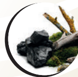
Vegetal Charcoal Purifying and withening effects