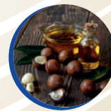
Macadamia Oil Soothing and conditioning